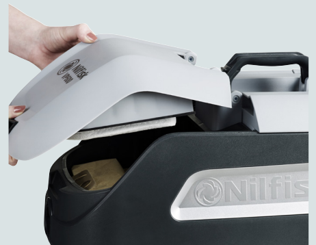
Magnetic hinges securing high reliability