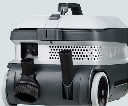
User friendly and easy to reach accessories