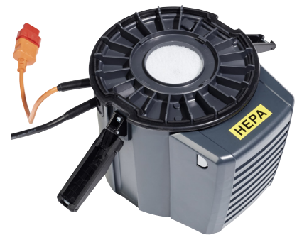
Easy to install HEPA exhaust filter as standard