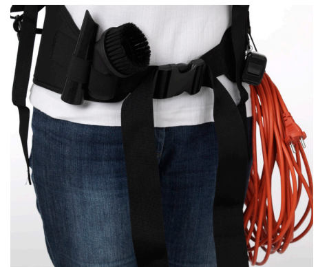
Accessories are stored on the belt for easy access