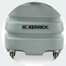
90L shock-proof container