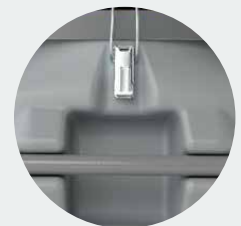
Motor head quick release

Kerrick Australia 1300 KERRICK (1300 537 742) sales@kerrick.com.au www.kerrick.com.au