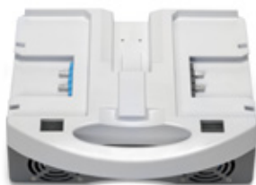
i-charge 9 (3 pieces)